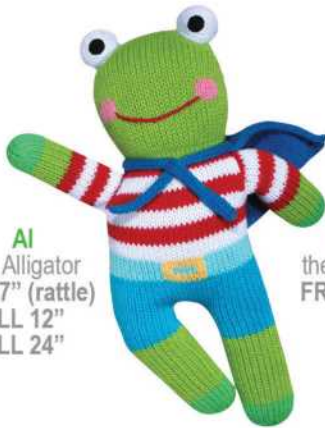
Freddy the Super Frog FRO 7" (rattle) FRO 12" FRO 24" FRO 36"