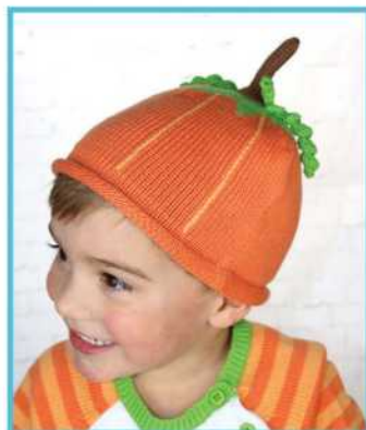
HAT - PUNH 0/6m, 6/12m, 1/2y, 2/3y