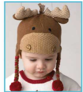
HAT - MOSH 6/12m, 1/2y, 2/3y