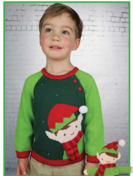
SWEATER - ELFBS 6m, 9m, 12m, 18m