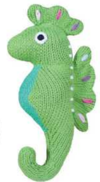
Susie the Seahorse SH 6" (rattle)