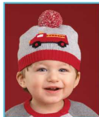
HAT - FTH 0/6m, 6/12m, 2/3y