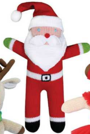
Mr. Claus Santa SAN 12"