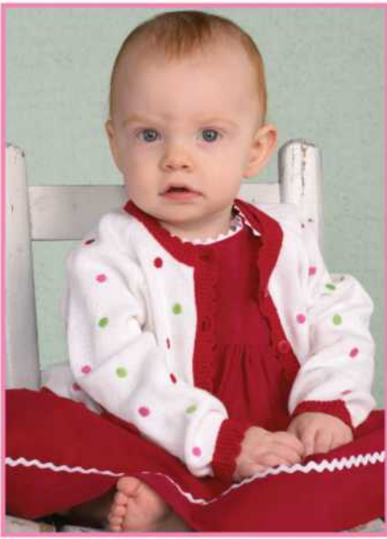
SWEATER - LOLIS 6m, 9m, 12m, 18m