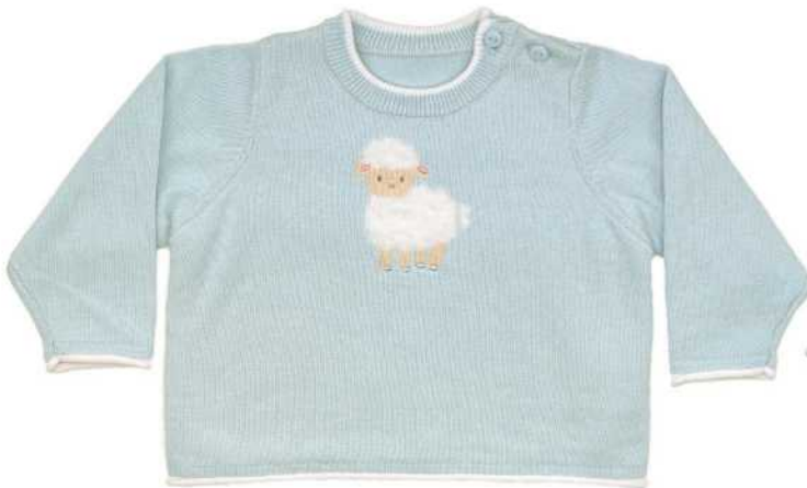
LMBS - fuzzy jacquard lamb 3m, 6m, 9m, 12m