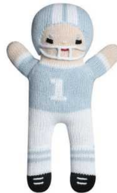
FP 7" LTB/WH FP 12" LTB/WH