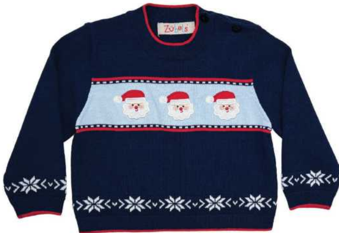
🌟 SANFS - jacquard snowflake pattern & appliquéd Santas 12m, 18m, 24m/2y, 3y, 4y