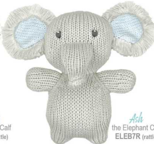
Ash the Elephant Calf ELEB7R (rattle)