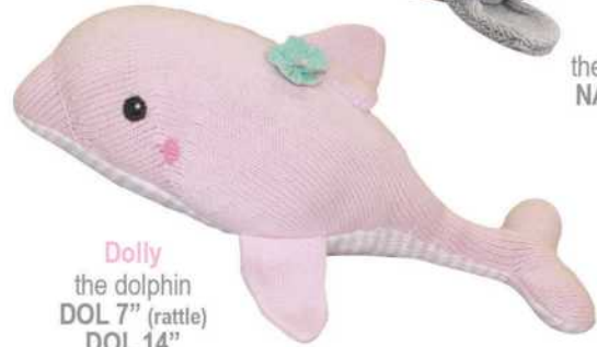
Dolly the dolphin DOL 7" (rattle) DOL 14"