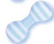
Blue & White Dumbell DB6"BL