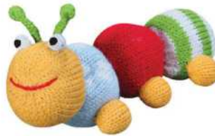
Nibbles the Caterpillar CPIL 5" (rattle)