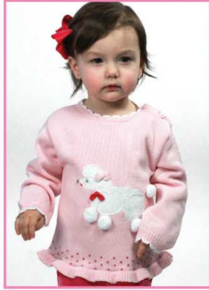
SWEATER - FRPS 6m, 9m, 12m, 18m