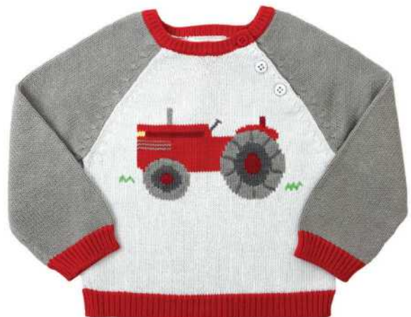
TRRS - intarsia tractor w/hand embroidery details 6m, 9m, 12m, 18m, 24m/2y, 3y, 4y