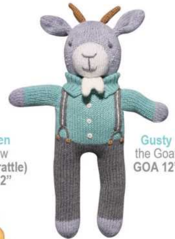
Gusty the Goat GOA 12"