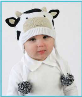
HAT - COWH 2/3y