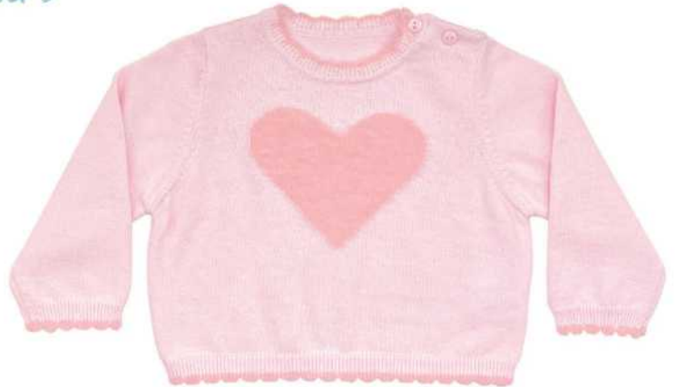
HEARTS - fuzzy yarn jacquard heart w/scallop tipping 3m, 6m, 9m, 12m, 18m, 24m/2y