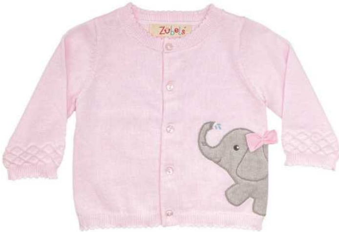
ELEGC - elephant appliqué w/texturen knit details & 3D bow 3m, 6m, 9m, 12m