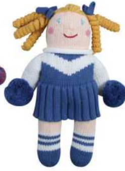
CHE 7" ROY/WH CHE 12" ROY/WH