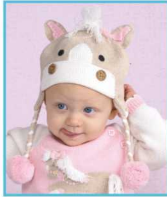
HAT - PONH 0/6m, 6/12m, 1/2y, 2/3y