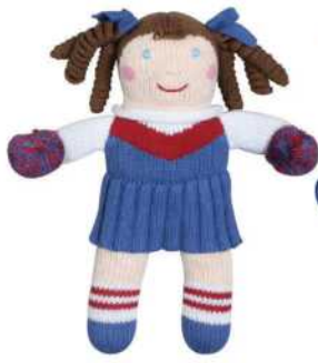
CHE 7" RD/ROY CHE 12" RD/ROY