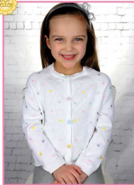
SWEATER - DOTS 3m, 6m, 9m, 12m, 18m, 24m/2y, 3y, 4y