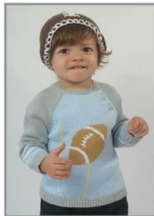
FBS-GY Special $15 6m, 9m FBSX-GY Special $19 5y, 6y, 7y