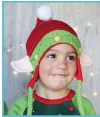
HAT - ELFH 0/6m, 6/12m, 2/3y