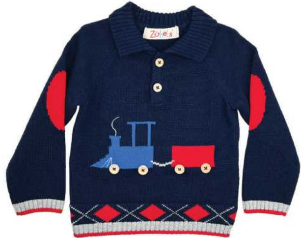
TRNSC - jacquard train w/button wheels 12m, 18m, 24m/2y, 3y, 4y, 5y, 6y