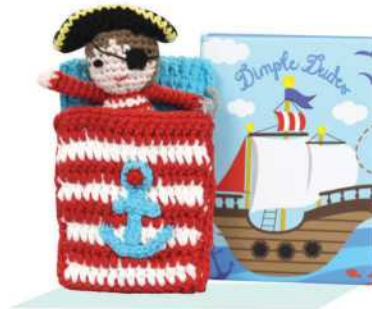
Captain Caleb DDPIR