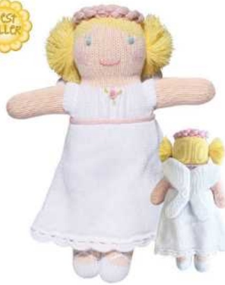
Grace the Angel ANG 7" (rattle) ANG 12"