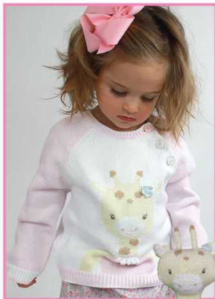
SWEATER - GIRGS 6m, 9m, 12m, 18m, 24m/2y