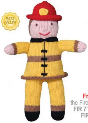
Frank the Fire Marshall FIR 7" (rattle) FIR 12"