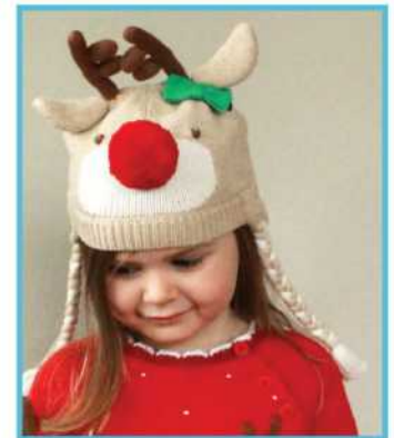
HAT - REIH 0/6m, 6/12m, 1/2y, 2/3y