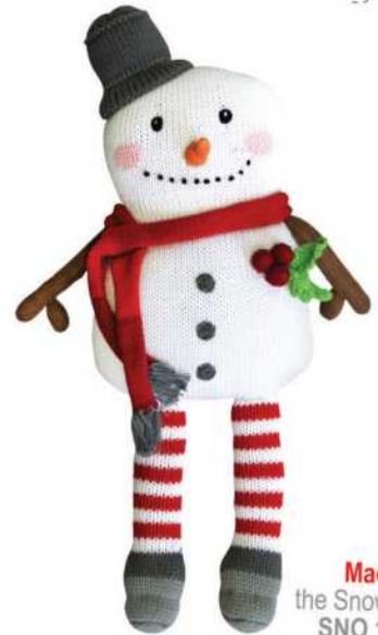
Mac the Snowman SNO 14"