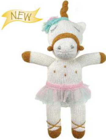
Rainbow Pop the Unicorn UNI 12"