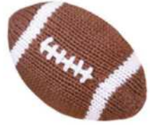
Phil the Football FB 5" (rattle)