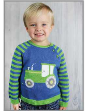
TRACS Special $15 6m, 9m TRACSX Special $19 5y, 6y, 7y