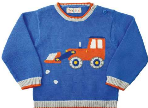
FLDS - intarsia front loader w/hand embroidery details 6m, 9m, 12m, 18m, 24m/2y, 3y, 4y