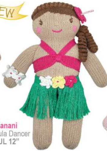
Kanani the Hula Dancer HUL 12"