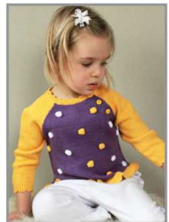
VARSB-PU/GLD Special $15 9m, 18m, 24m