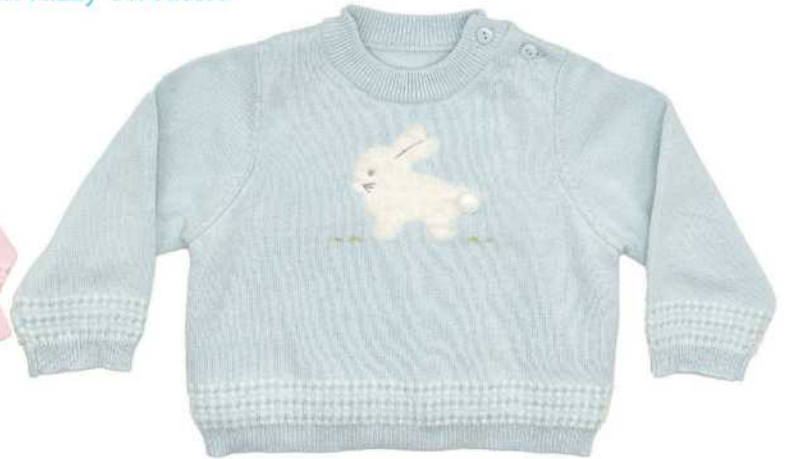
BUNBS - fuzzy jacquard pattern & bunny 3m, 6m, 9m, 12m, 18m, 24m/2y