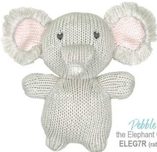
Pebble the Elephant Calf ELEG7R (rattle)