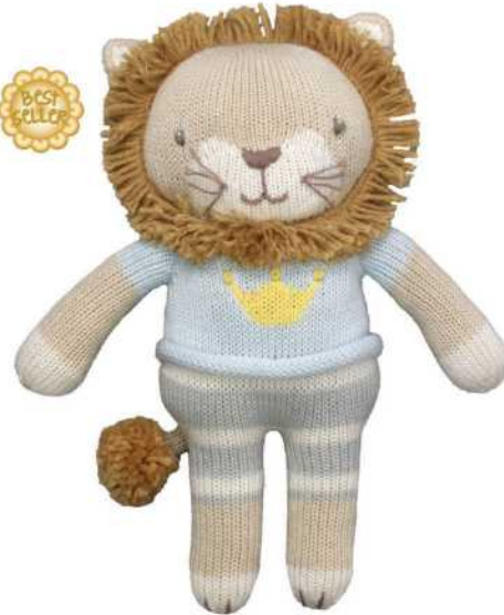
Loki the Lion LIOB12"