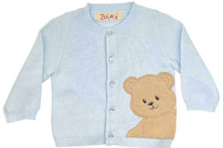
BEABC - fuzzy knit bear appliqué 3m, 6m, 9m, 12m