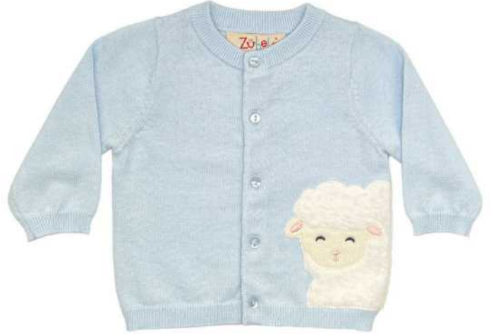
LAMBC - fuzzy knit lamb appliqué 3m, 6m, 9m, 12m