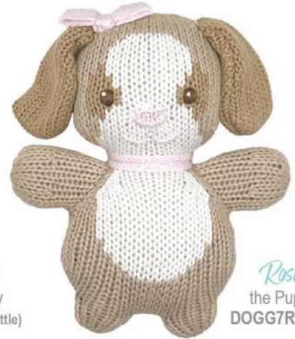
Rosie the Puppy DOGG7R (rattle)