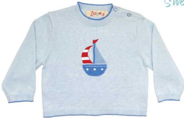
SAIBS - jacquard sailboat w/embroidery 3m, 6m, 9m, 12m, 18m, 24m/2y