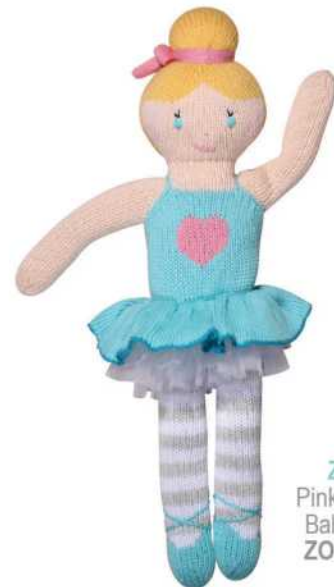
Zoe Pink Heart Ballerina ZOE 14"