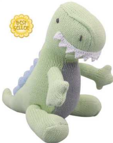
Truman the T-Rex TRES 12"