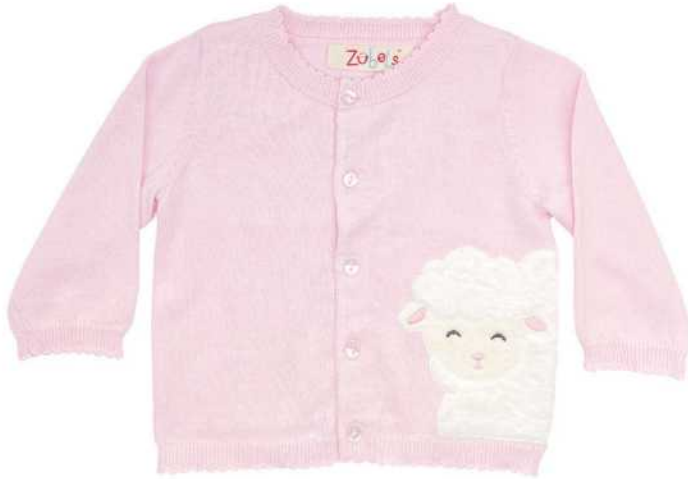
LAMGC - fuzzy knit lamb appliqué 3m, 6m, 9m, 12m