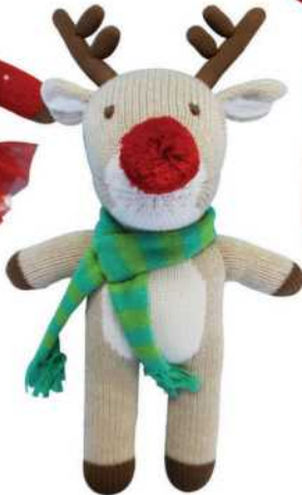
Rooney the Reindeer REIB 12"