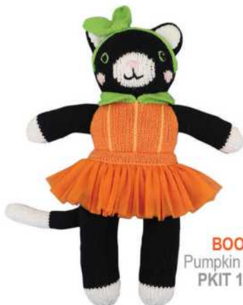
BOO Pumpkin Kitty PKIT 12"