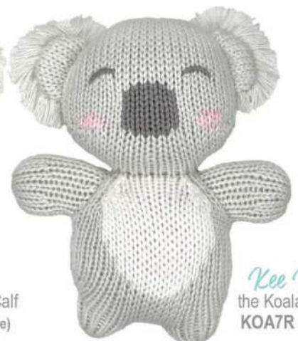
Kee Kee the Koala Joey KOA7R (rattle)