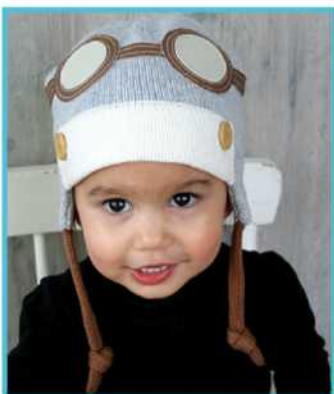
HAT - AIRH 0/6m, 6/12m, 2/3y