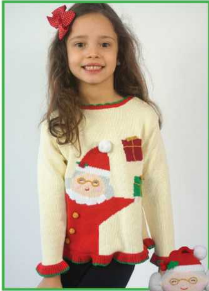
SWEATER - SANGS 6m, 9m, 12m, 18m, 24m/2y, 3y, 4y SANGSX - 5y, 6y, 7y