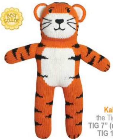
Kai the Tiger TIG 7" (rattle) TIG 12"