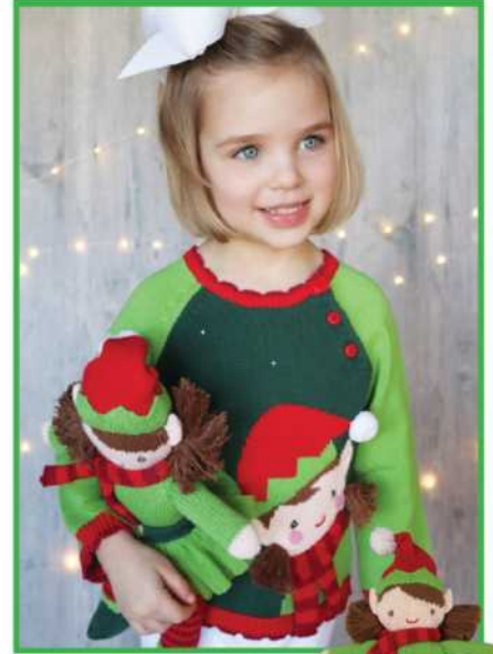
SWEATER - ELFGS 6m, 9m, 12m, 18m, 24m/2y, 3y, 4y