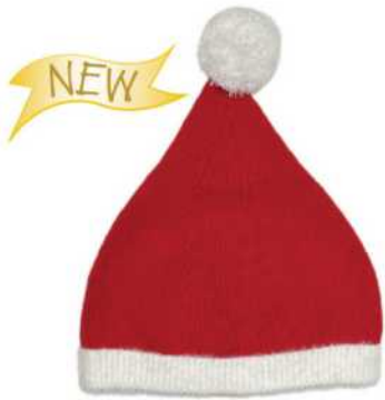
HAT - SANH NEW fully fashioned hat w/fuzzy yarn rib knit brim 6/12m, 1/2y, 2/3y, 4/5y