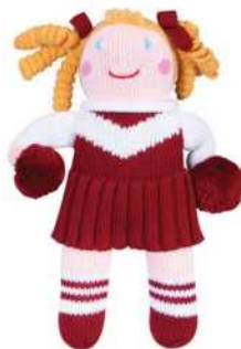
CHE 7" MAR/WH CHE 12" MAR/WH