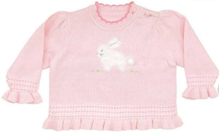
BUNGS - fuzzy jacquard pattern & bunny 3m, 6m, 9m, 12m, 18m, 24m/2y