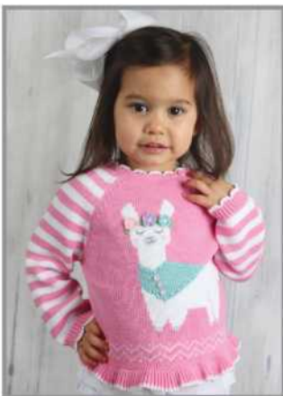
LAMAS Special $18 6m, 9m, 12m, 18m LAMASX Special $19 5y, 6y, 7y