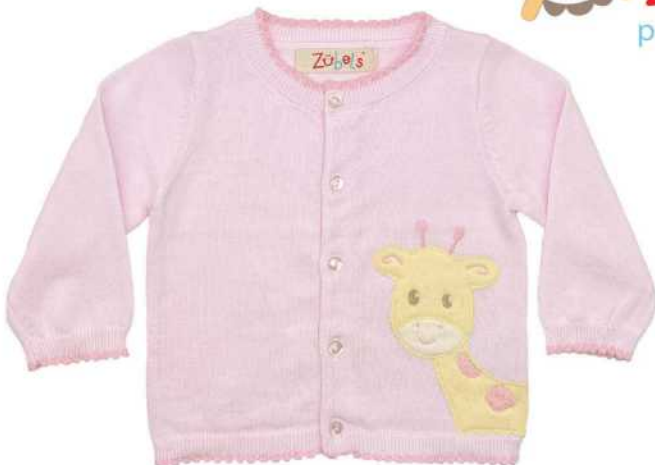
GIRGC - knit appliqué giraffe 3m, 6m, 9m, 12m