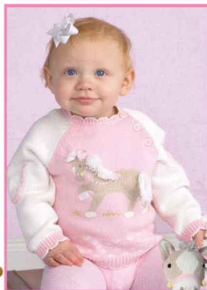
SWEATER - PONS 6m, 9m, 12m, 18m, 24m/2y, 3y, 4y