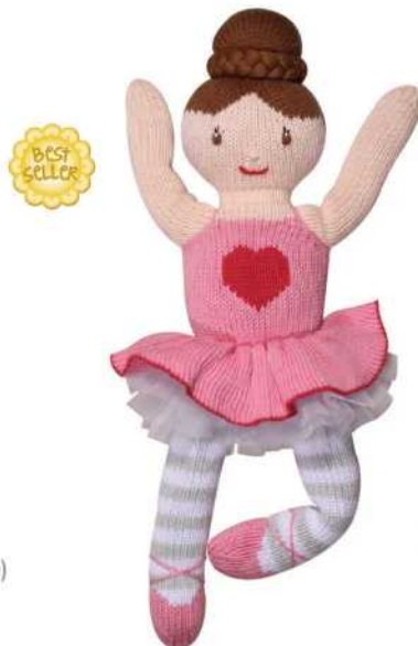
Eva Red Heart Ballerina EVA 14"