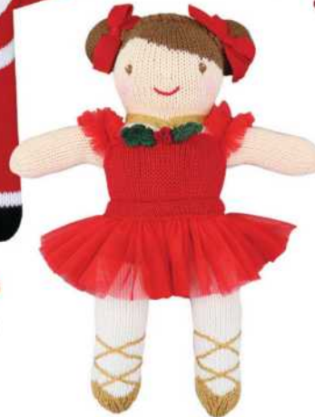
Holly the Holiday Ballerina HOLID 12"