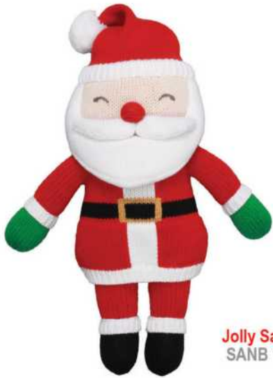
Jolly Santa SANB 12"