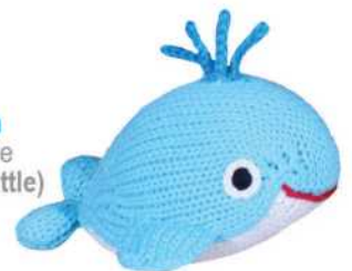
Watson the Whale WHA 6" (rattle)