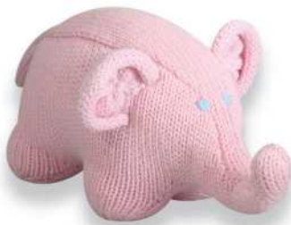
Pink Elephant ELE8-PK (rattle)