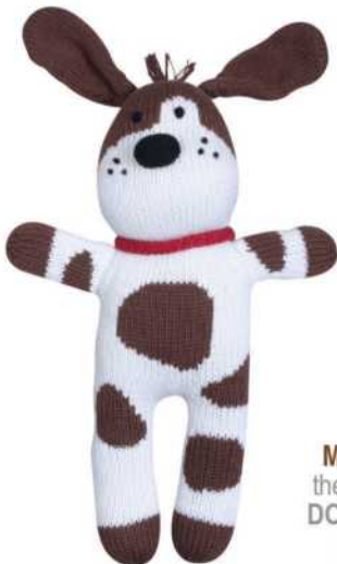
Mr. Whoofers the Spotted Dog DOGS 7" (rattle) DOGS 12"