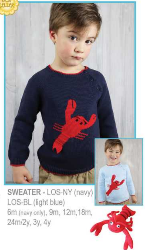
SWEATER - LOS-NY (navy) LOS-BL (light blue) 6m (navy only), 9m, 12m, 18m, 24m/2y, 3y, 4y