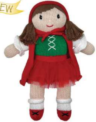
Ruby with a little red hood RED 12"