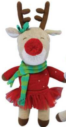
Ruby the Reindeer REIG 12"