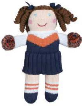
CHE 7" OR/NY CHE 12" OR/NY