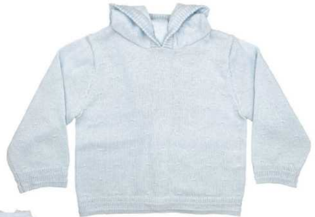
Back Zip Cardigan