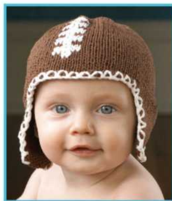
HAT - FBH-GY 0/6m, 6/12m, 1/2y, 2/3y