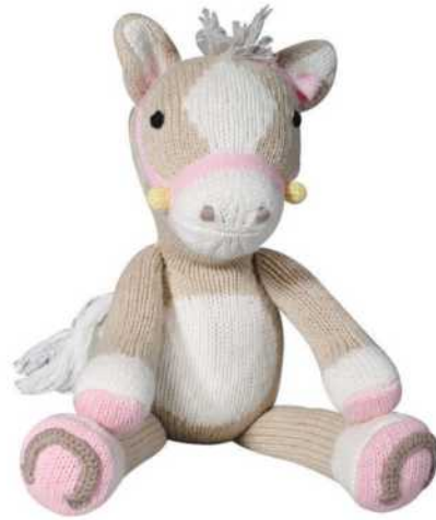
Josie the Pony PON 14"