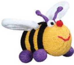
Elizabeth the Bee BEE 5" (rattle)