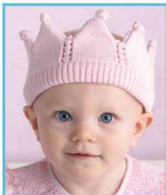
HAT - CROHP 1/2y, 2/3y