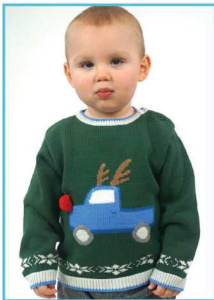
SWEATER - REITS 6m, 9m, 12m, 18m, 24m/2y, 3y, 4y