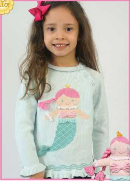
SWEATER - WMERS 6m, 9m, 12m, 18m, 24m/2y, 3y, 4y WMERSX- 5y, 6y, 7y