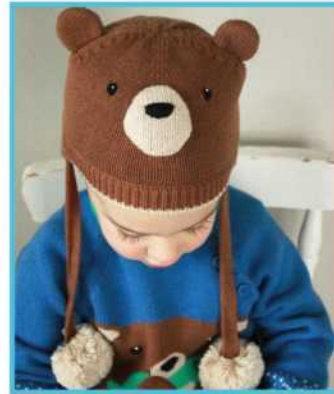
HAT - BBEAH 0/6m, 6/12m, 2/3y