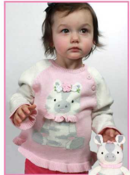
SWEATER - ZEBS 6m, 9m, 12m, 18m, 24m/2y, 3y, 4y