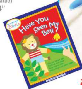
*Sweater no longer available ZBOOK1 (Zubels interactive book)