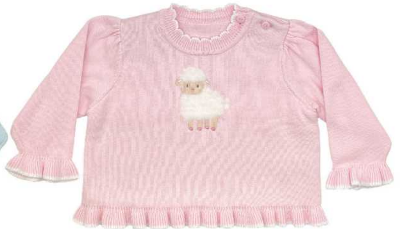
LMGS - fuzzy jacquard lamb 3m, 6m, 9m, 12m