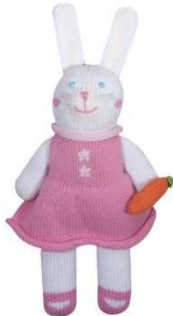
Harriet Girl Bunny BUNG 7" (rattle) BUNG 12"