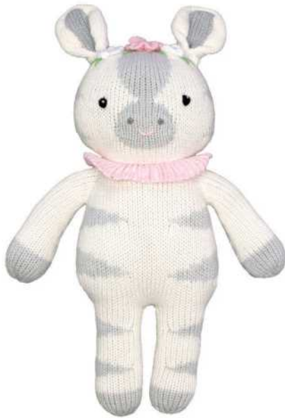
Zsa Zsa the Zebra ZEBG12"