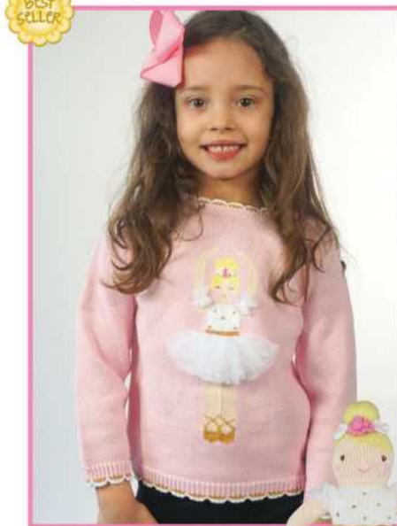
SWEATER - BALWS 6m, 9m, 12m, 18m, 24m/2y BALWSX - 5y, 6y, 7y