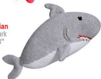
Sebastian the Shark SHA 8"