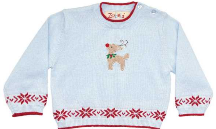
REINBS - knit appliqué reindeer 3m, 6m, 9m, 12m, 18m, 24m/2y