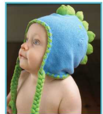
HAT - DINH 6/12m, 1/2y, 2/3y