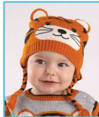
HAT - TIH 0/6m, 6/12m, 1/2y, 2/3y