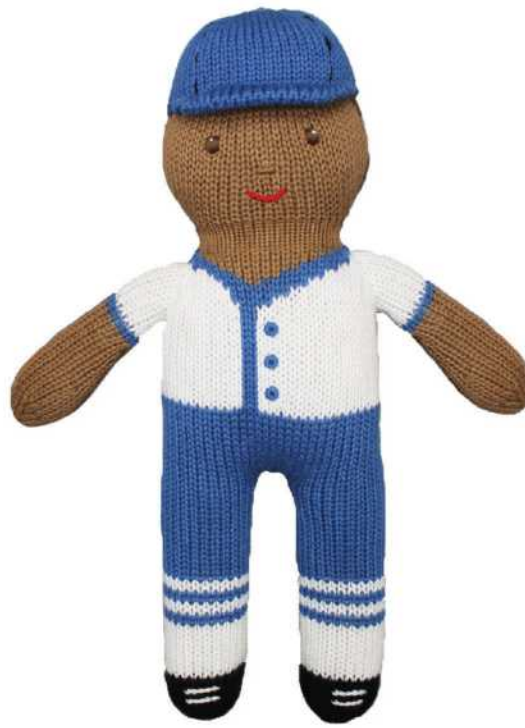
Briggs the Baseball Player BB12-ROY/WH