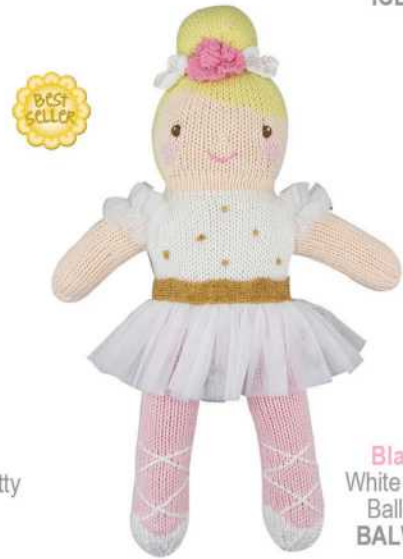
Blakely White & Gold Ballerina BALW 12"