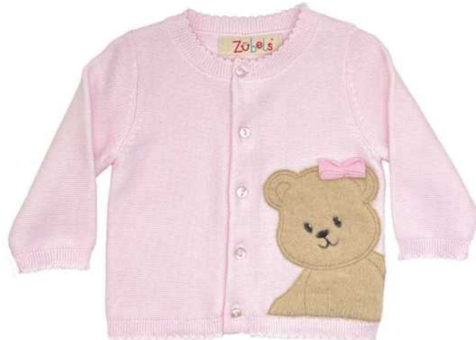
BEAGC - fuzzy knit bear appliqué & 3D bow 3m, 6m, 9m, 12m