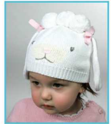
HAT - FRPH 0/6m, 6/12m, 1/2y