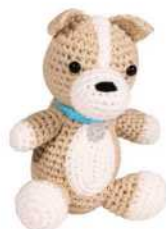
DOG 4" (non-rattle)