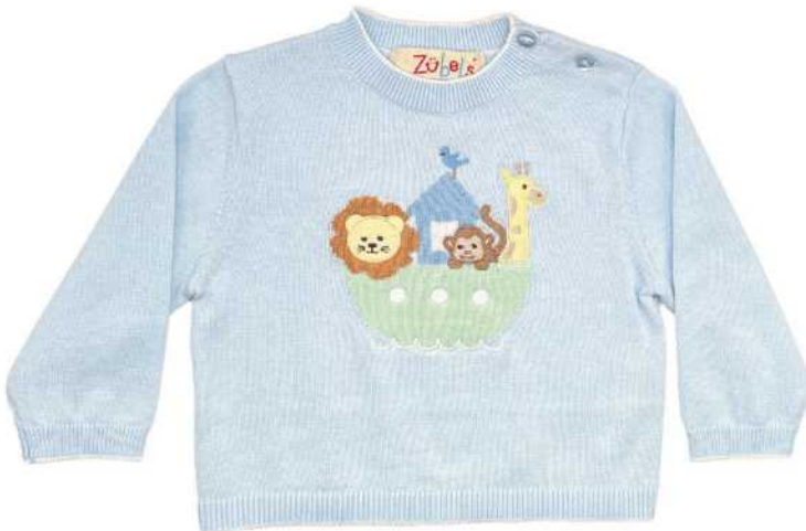
NOABS - combination of jacquard and appliqué knit 3m, 6m, 9m, 12m, 18m, 24m/2y