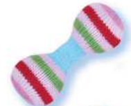
Multi-color Dumbell DB6"AQ