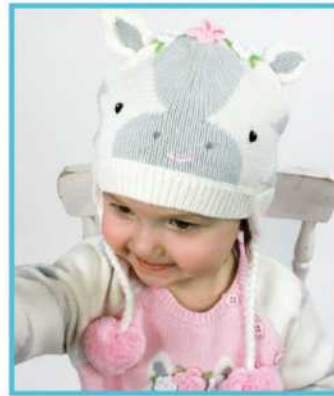
HAT - ZEBH 0/6m, 6/12m, 1/2y