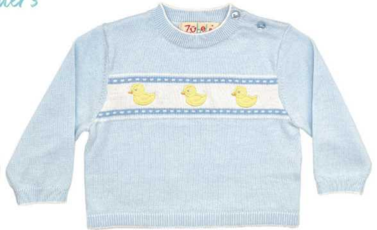
DUCBS - appliqué knit ducks 3m, 6m, 9m, 12m