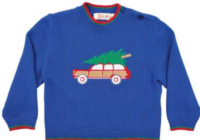
🌟 XMASCS - jacquard & appliquéd car w/tree 6m, 9m, 12m, 18m, 24m/2y, 3y, 4y, 5y, 6y