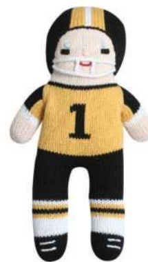
FP 7" GLD/BK FP 12" GLD/BK