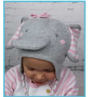
HAT - ELEGH 0/6m, 6/12m, 2/3y