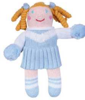
CHE 7" LTB/WH CHE 12" LTB/WH