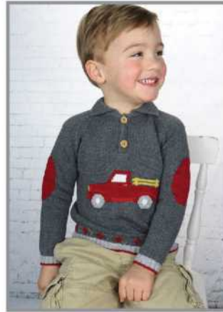
TRUKC Special $19 6y, 7y