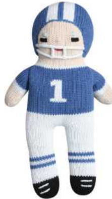
FP 7" ROY/WH FP 12" ROY/WH