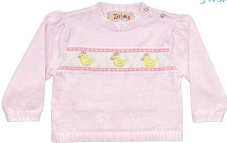
DUCGS - appliqué knit ducks 3m, 6m, 9m, 12m