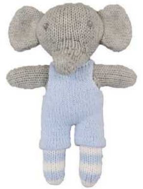
Bertie the Blue Elephant ELEB 7" (rattle)