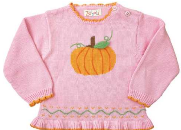
PUMS - intarsia pumpkin w/3D leaf, fair isle pattern 6m, 9m, 12m, 18m, 24m/2y, 3y, 4y