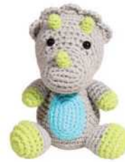
TRI 4" (non-rattle) TRI4R