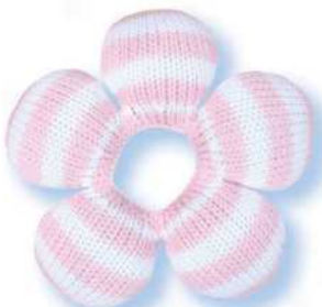
Pink & White flower FL6"PK