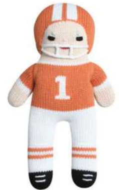
FP 7" OR/WH FP 12" OR/WH