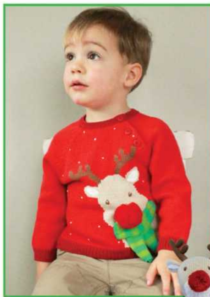
SWEATER - REBS 6m, 9m, 12m, 18m, 24m/2y, 3y, 4y