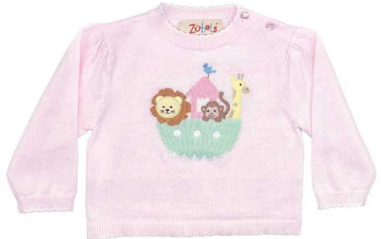
NOAGS - combination of jacquard and appliqué knit 3m, 6m, 9m, 12m, 18m, 24m/2y