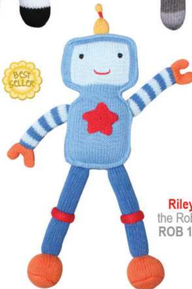
Riley the Robot ROB 14"