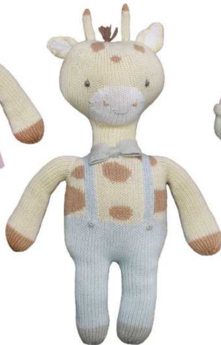
George the Giraffe GIRB16"