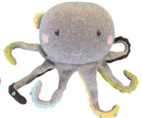
Ollie the Octopus OCT 12" (rattle)