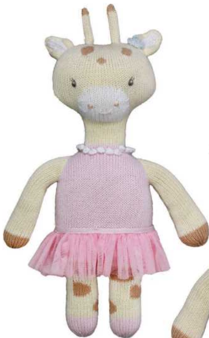
Gisele the Giraffe GIRG16"