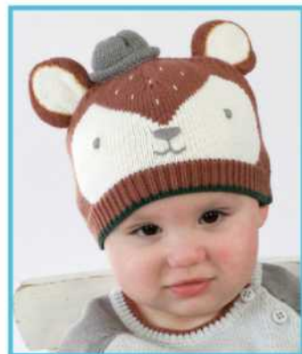
HAT - FOXBH 6/12m, 1/2y, 2/3y