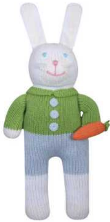
London Collin Boy Bunny BUNB 7" (rattle) BUNB 12"