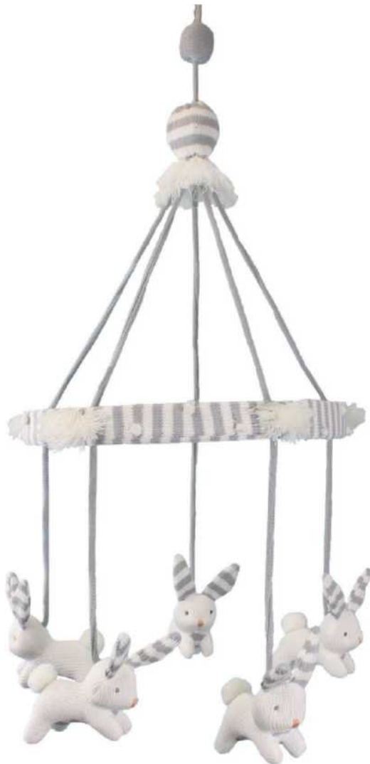
MOBBUN 13" Diameter 27"-55" Adjustable string height