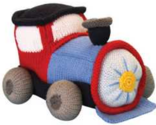
Timmy the Train TRS 7"