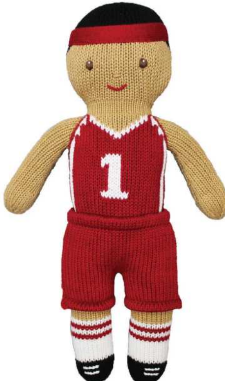
Jordan the Basketball Player BSK14-RD/WH