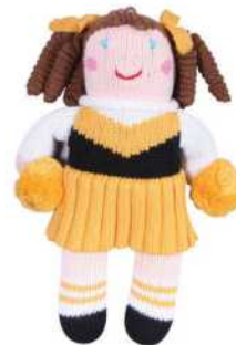
CHE 7" GLD/BK CHE 12" GLD/BK