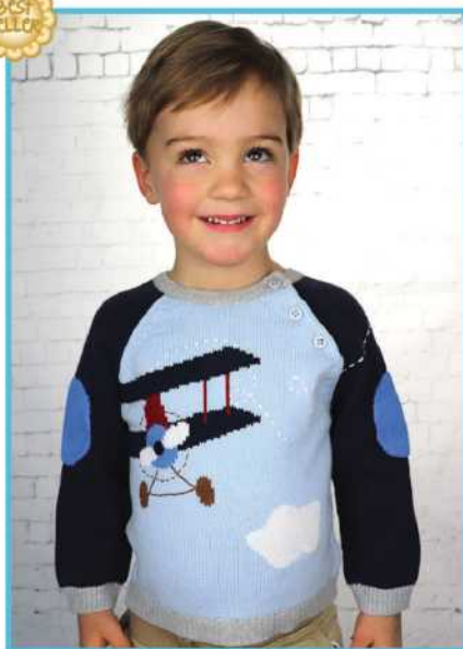
SWEATER - AIRPS 6m, 9m, 12m, 18m, 24m/2y, 3y, 4y AIRPSX - 5y, 6y, 7y