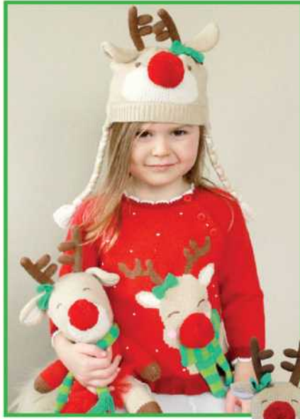
SWEATER - REGS 6m, 9m, 12m, 18m, 24m/2y, 3y, 4y