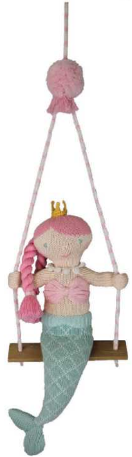
MOBSME 15"-31" adjustable string height