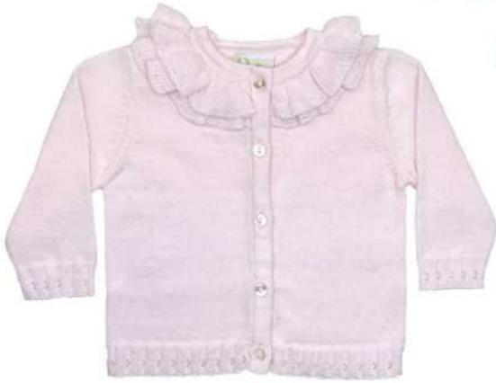
Cardigan (pointelle ruffle collar)