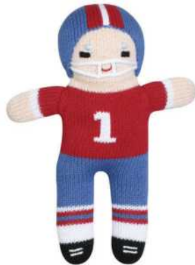
FP 7" RD/ROY FP 12" RD/ROY