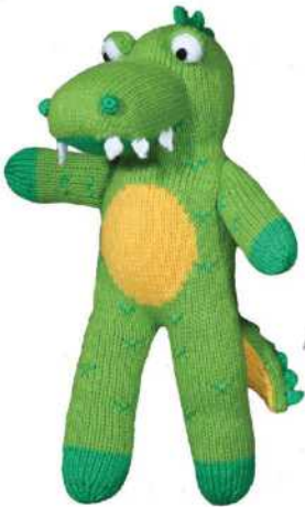
Al the Alligator ALL 7" (rattle) ALL 12" ALL 24"