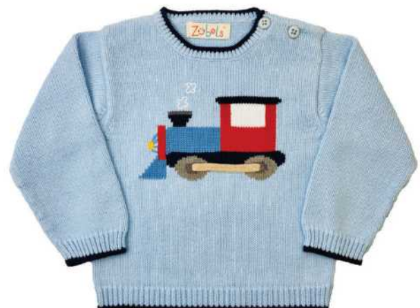
TRS - intarsia train w/hand embroidery details 6m, 9m, 12m, 18m, 24m/2y, 3y, 4y