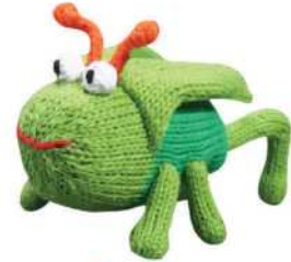
Gordan the Grasshopper GHOP 5" (rattle)