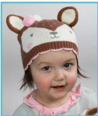
HAT - FOXGH 6/12m, 1/2y, 2/3y