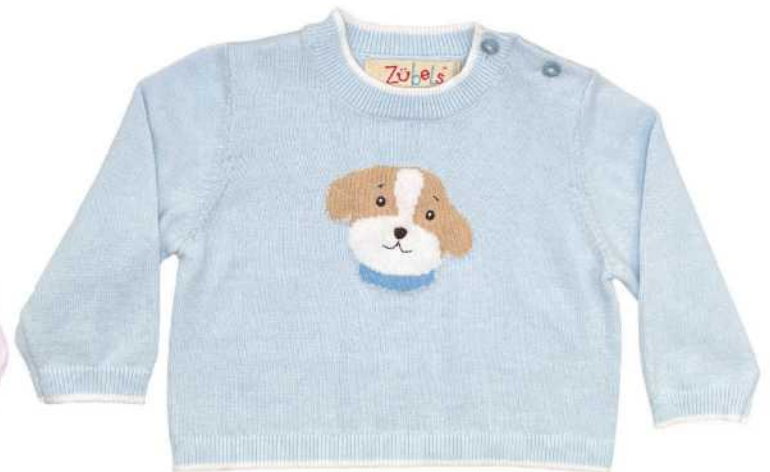
DOGBS - jacquard knit with embroidery 3m, 6m, 9m, 12m, 18m, 24m/2y