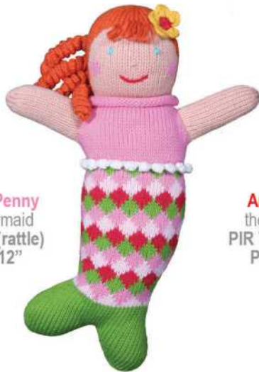
Pearly Penny the Mermaid MER 7" (rattle) MER 12"