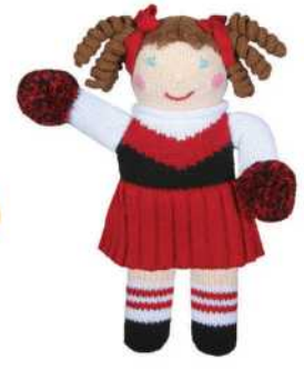
CHE 7" RD/BK CHE 12" RD/BK