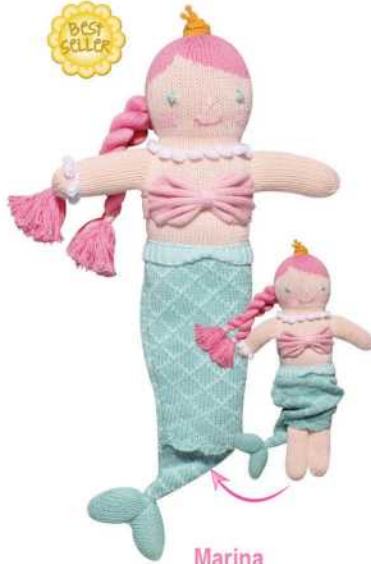
Marina the walking mermaid WMER 7" (non-walking rattle) WMER 12" WMER 18"