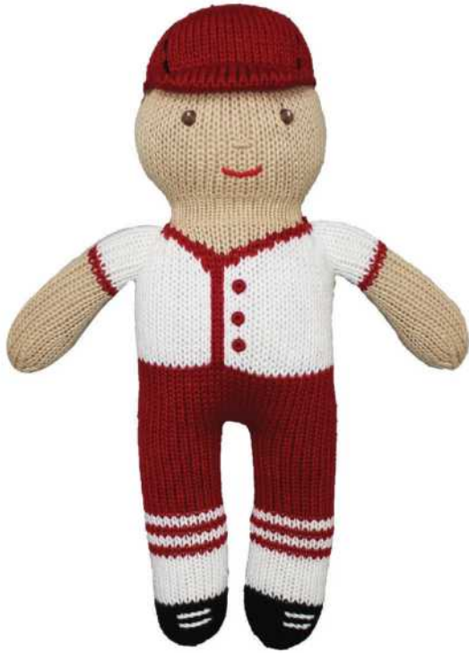
Brady the Baseball Player BB12-RD/WH