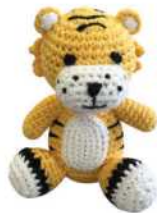
TIG 4" (non-rattle) TIG4R