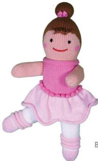
Bella Ballerina BAL 7" (rattle) BAL 12" *BAL 36"