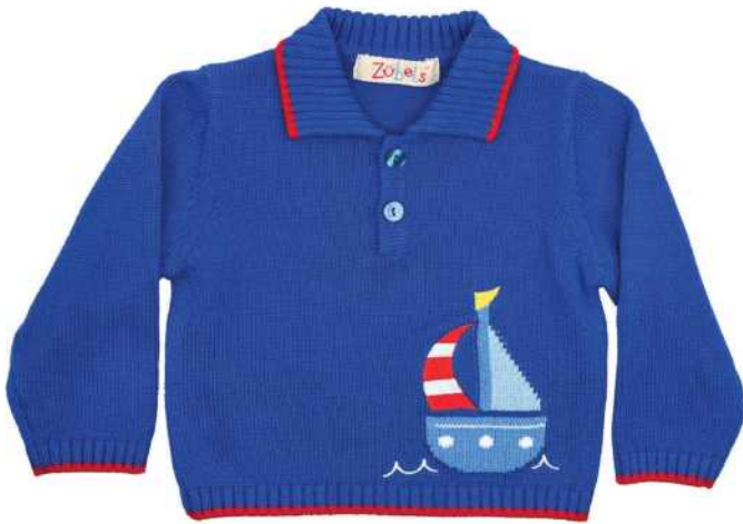
SAILSC - jacquard boat w/embroidery 12m, 18m, 24m/2y, 3y, 4y