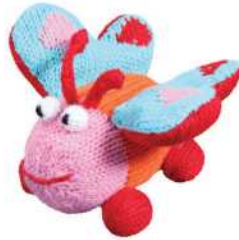
Franny the Butterfly BUT 5" (rattle)