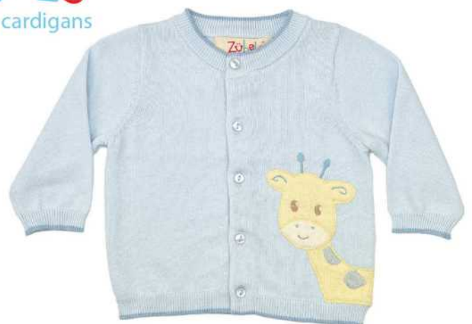
GIRBC - knit appliqué giraffe 3m, 6m, 9m, 12m