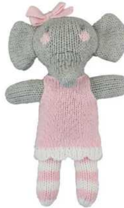
Edna the Pink Elephant ELEG 7" (rattle)