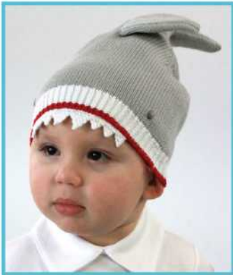
HAT - SHARH 6/12m, 1/2y, 2/3y SHARHX - ONE SIZE FITS MOST