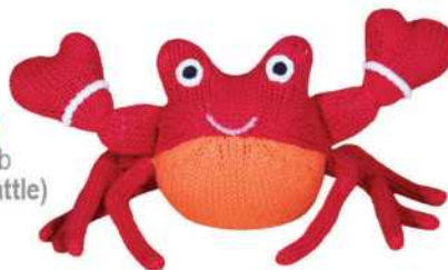
Corey the Crab CRA 6" (rattle)