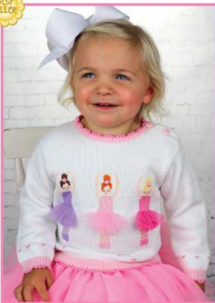
SWEATER - BALS 6m, 9m, 12m, 18m, 24m/2y, 3y, 4y BALXS - 5y, 6y, 7y