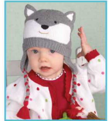
HAT - WOLH 6/12m, 1/2y, 2/3y