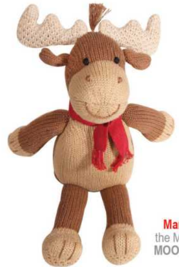
Marley the Moose MOOS 14"