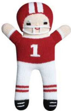
FP 7" RD/WH FP 12" RD/WH