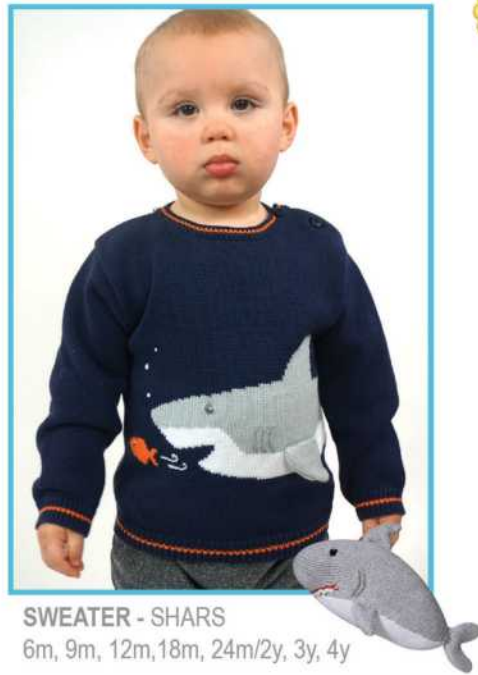
SWEATER - SHARS 6m, 9m, 12m, 18m, 24m/2y, 3y, 4y