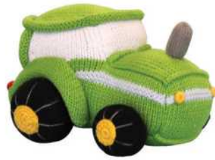
Tobey the Tractor TRA 7"