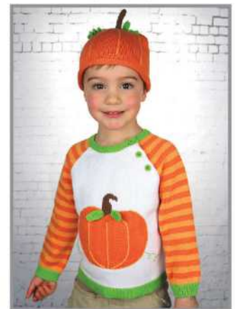
PUNS Special $18 6m, 9m, 3y, 4y