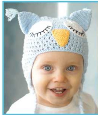
HAT - OWHF-BL 0/6m, 6/12m, 1/2y, 2/3y