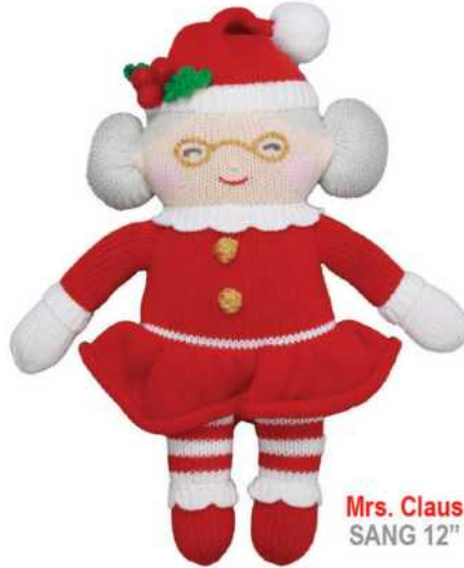
Mrs. Claus SANG 12"