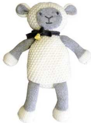
Lola the Lamb LAM 7" (rattle) LAM 12"