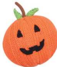
Punkin' the Pumpkin PUMP 5" (rattle)