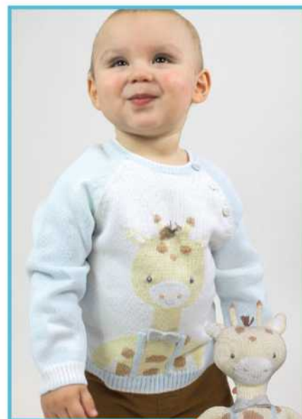
SWEATER - GIRBS 6m, 9m, 12m, 18m, 24m/2y