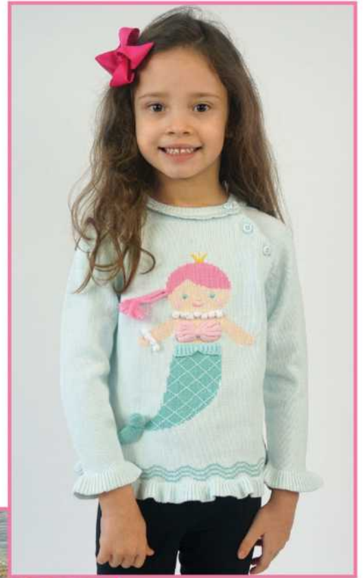
Marina the walking mermaid sweater WMERS WMERSX