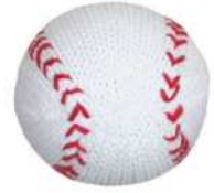
Will the Baseball BB 5" (rattle)