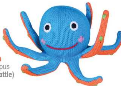
Oshin the Octopus OCT 6" (rattle)