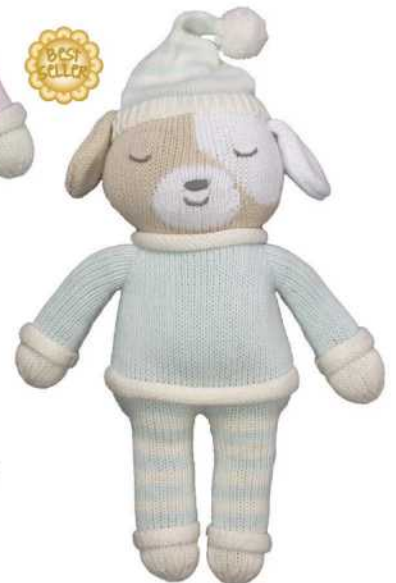
Patches Puppy in PJ's ready for his nap DOGB12"