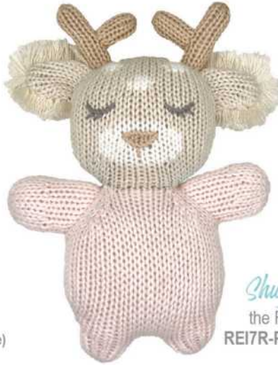
Shuggie the Fawn REI7R-PK (rattle)