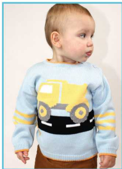
SWEATER - TONS 6m, 9m, 12m, 18m, 24m/2y