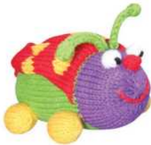
Laneybug the Ladybug LBU 5" (rattle)