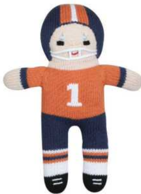
FP 7" OR/NY FP 12" OR/NY