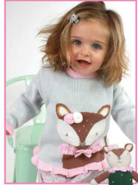
SWEATER - FOXGS 6m, 9m, 12m, 18m, 24m/2y, 3y, 4y