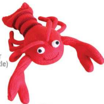
Larry the lobster LOB 7" (rattle)