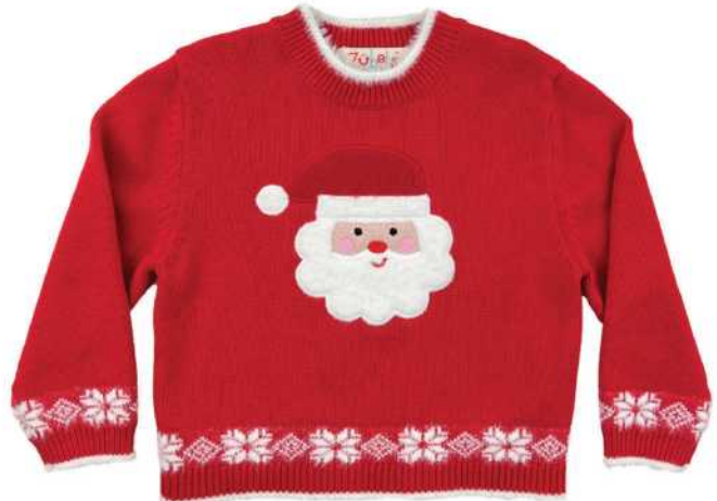
🌟 SANTS - fuzzy snowflake pattern & fuzzy appliquéd Santa 12m, 18m, 24m/2y, 3y, 4y, 5y, 6y