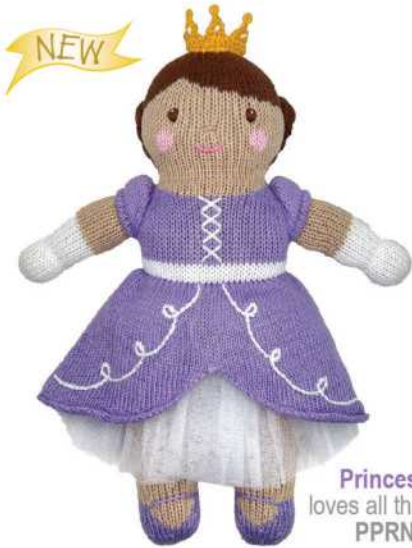
Princess Plum loves all things Purple PPRN12-LV