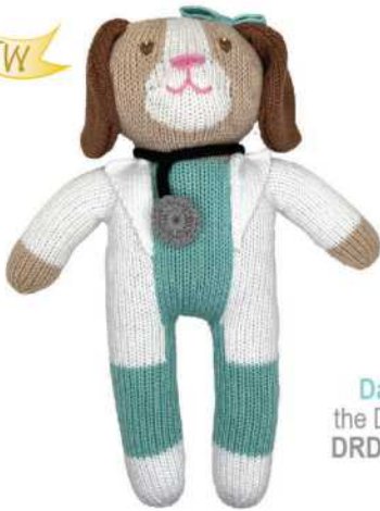
Darci the Doctor DRDG 12"