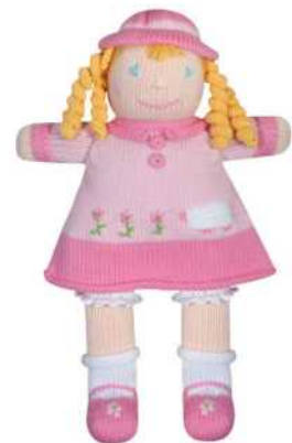
Little Bow Sheep Herder PEEP 7" (rattle) PEEP 12"