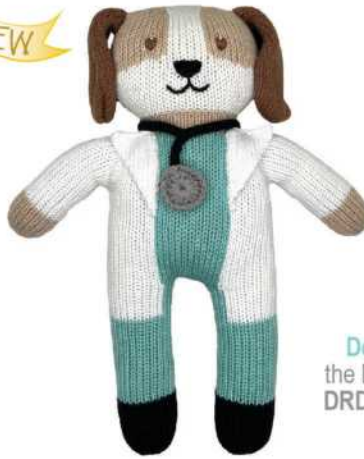
Dolce the Doctor DRDB 12"