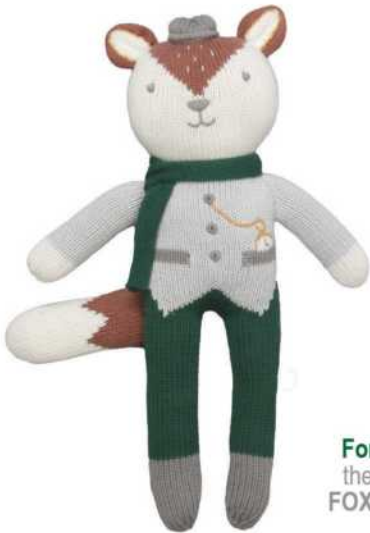
Forrest the Fox FOXG 12"