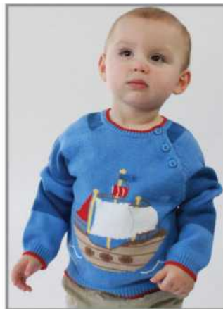
SHIPSX Special $19 6y, 7y