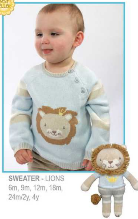
SWEATER - LIONS 6m, 9m, 12m, 18m, 24m/2y, 4y