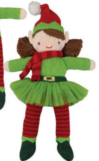
Esther the girl Elf ELG 12"