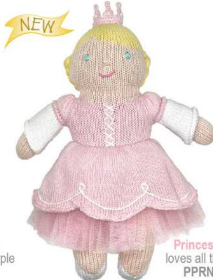
Princess Posey loves all things Pink PPRN12-PK