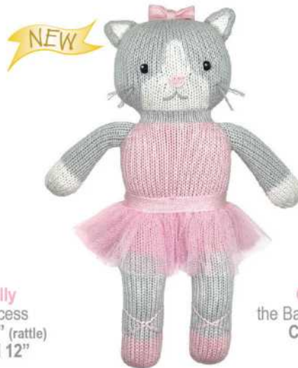
Callie the Ballerina Kitty CAT12"