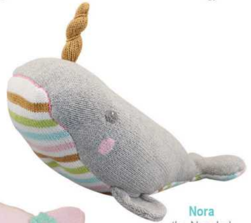
Nora the Narwhal NARW 14"