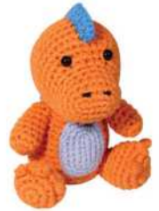
TRE 4" (non-rattle)