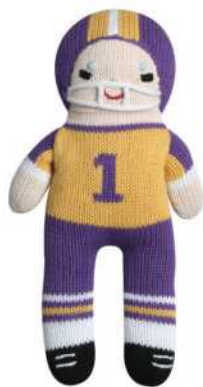
FP 7" PU/GLD FP 12" PU/GLD