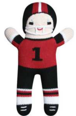
FP 7" RD/BK FP 12" RD/BK