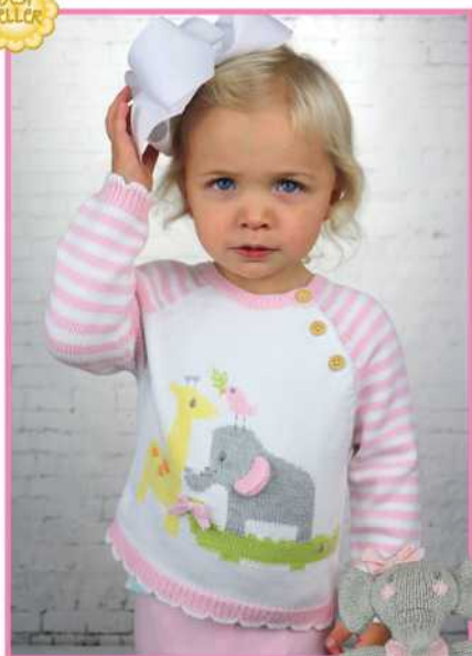
SWEATER - NURGS 3m, 6m, 9m, 12m, 18m, 24m/2y