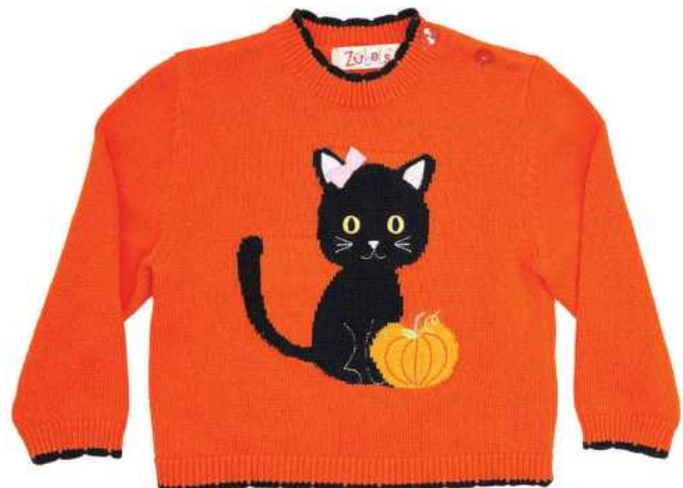
PKITS - jacquard kitty & pumpkin w/3D bow 12m, 18m, 24m/2y, 3y, 4y, 5y, 6y