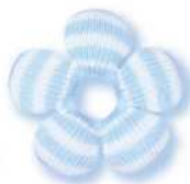
Blue & White flower FL6"BL