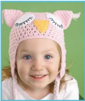
HAT - OWHF-PK 0/6m, 6/12m, 1/2y, 2/3y