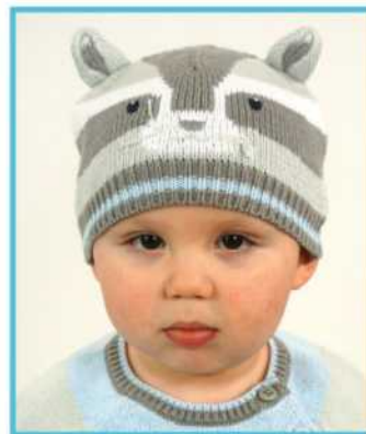
HAT - RACCH 0/6m, 6/12m, 1/2y