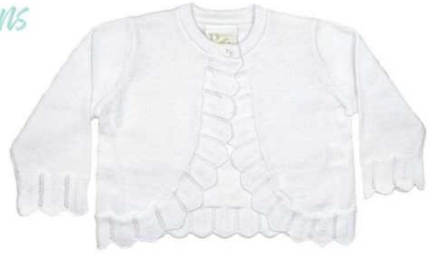
Bolero Cardigan (pointelle finish)