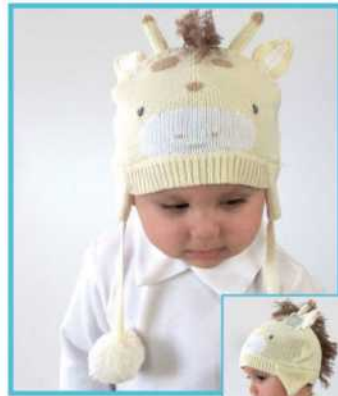
HAT - GIRBH GIRGH 0/6m, 6/12m, 1/2y (boy only)