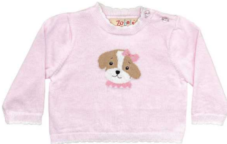
DOGGS - jacquard knit with embroidery 3m, 6m, 9m, 12m, 18m, 24m/2y