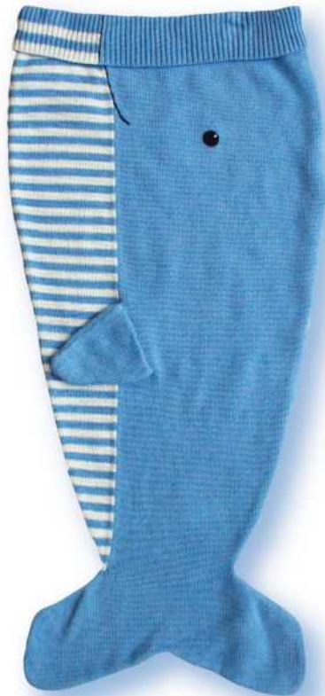
WHAB Whale Tail Blanket