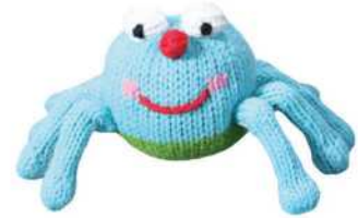
Stanley the Spider SPI 5" (rattle)