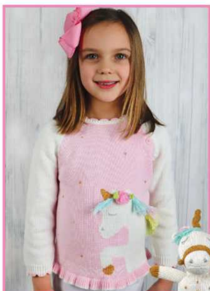
SWEATER - UNICS 6m, 9m, 12m, 18m, 24m/2y, 3y, 4y UNICSX - 5y, 6y, 7y *New toy matches sweater