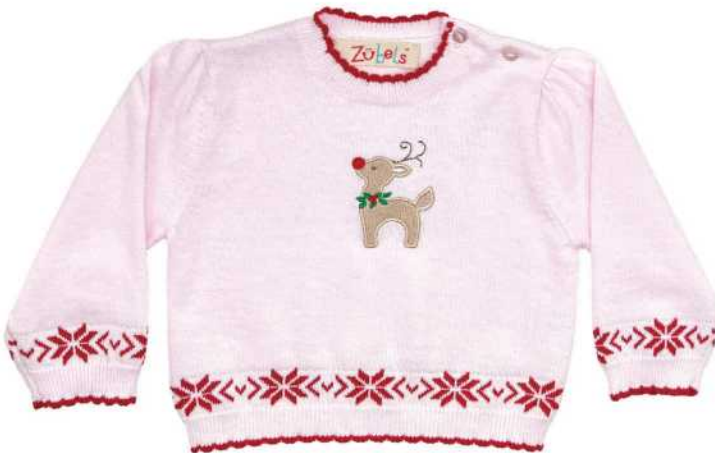
REINGS - knit appliqué reindeer 3m, 6m, 9m, 12m, 18m, 24m/2y