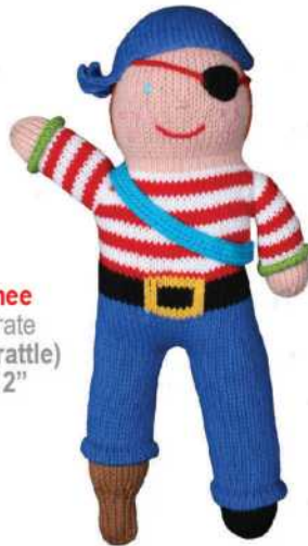
Arrr-nee the Pirate PIR 7" (rattle) PIR 12"