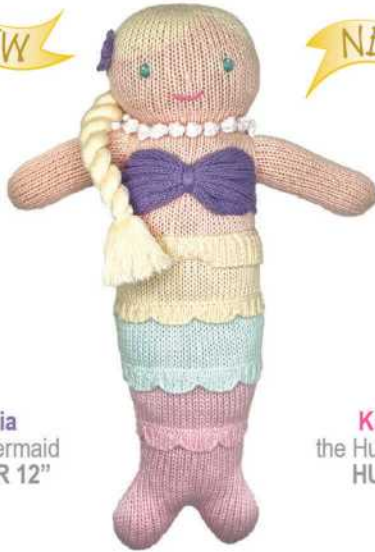
Mia the Mermaid PMER 12"