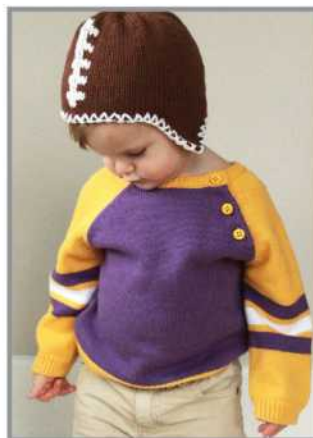
VARSB-PU/GLD Special $15 9m, 12m, 18m