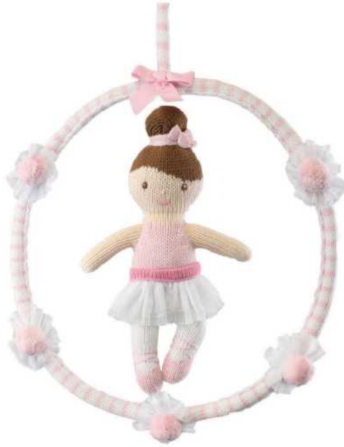
MOBBAL 13" Diameter 22"-47" Adjustable string height