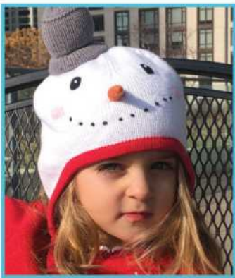
HAT - SNOMH 0/6m, 6/12m, 1/2y, 2/3y