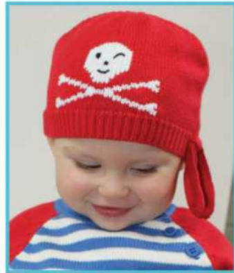
HAT - PIRH 6/12m, 1/2y