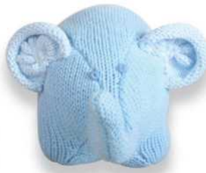
Blue Elephant ELE8-BL (rattle)