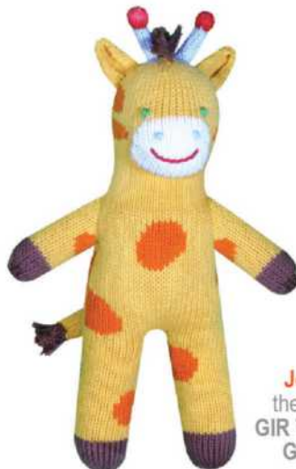
Joshua the Giraffe GIR 7" (rattle) GIR 12"