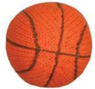
Bill the Basketball BK 5" (rattle)