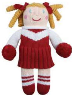
CHE 7" RD/WH CHE 12" RD/WH