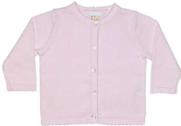
Scallop Edge Cardigan