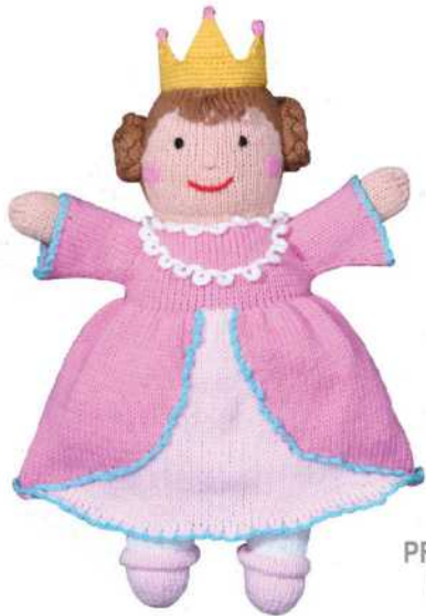
Milly Princess PRN 7" (rattle) PRN 12"