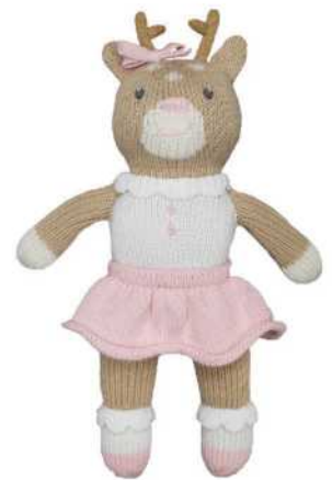
Fawn the Baby Doe DEERG 12"