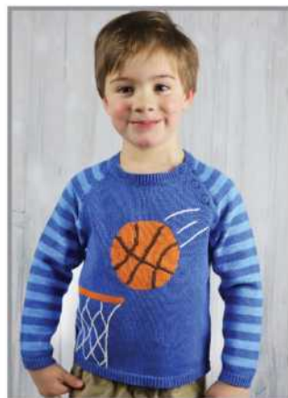
BASKS Special $15 6m, 9m, 12m, 18m, 24m/2y