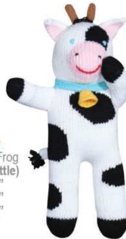
Cowleen the Cow COW 7" (rattle) COW 12"