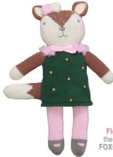
Flora the Fox FOXG 12"