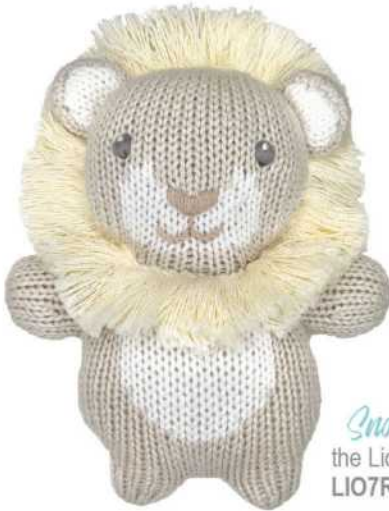
Snookie the Lion Cub LIO7R (rattle)