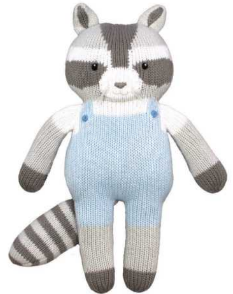
Bandit the Raccoon RACC12"