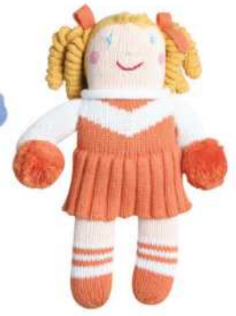
CHE 7" OR/WH CHE 12" OR/WH