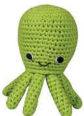
OCT 4" (non-rattle) OCT4R