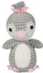
PEN 4" (non-rattle) PEN4R