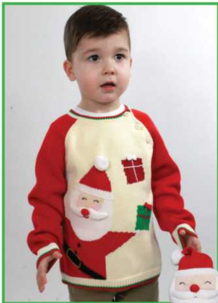
SWEATER - SANBS 6m, 9m, 12m, 18m, 24m/2y, 3y, 4y SANBSX - 5y, 6y, 7y