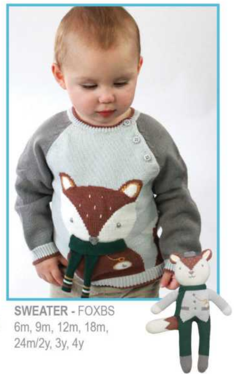
SWEATER - FOXBS 6m, 9m, 12m, 18m, 24m/2y, 3y, 4y