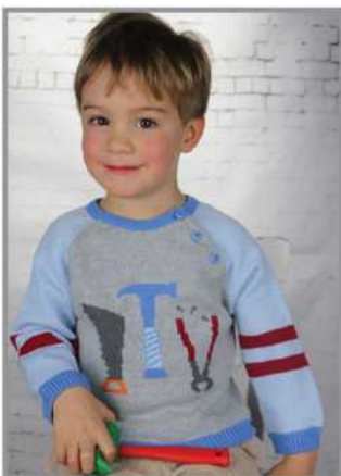
TOOLS Special $15 12m