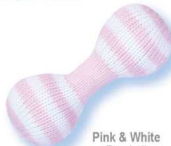
Pink & White Dumbell DB6"PK