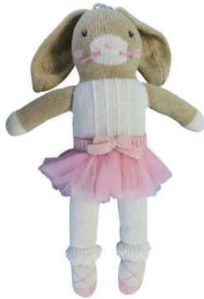
Betsie the Bunny BBUN 7" (rattle) BBUN 12" BBUN 18"