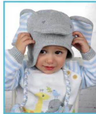
HAT - ELEBH 6/12m, 2/3y