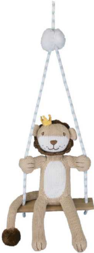
MOBSLIO 15"-31" adjustable string height