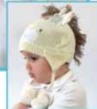
(Girls giraffe hat has crochet blue flower)