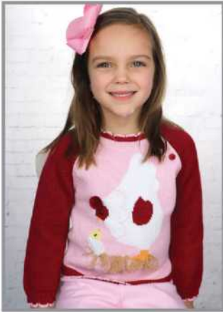
CHICS Special $15 6m, 9m, 12m, 18m