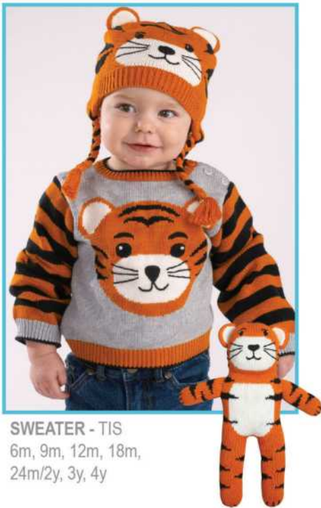
SWEATER - TIS 6m, 9m, 12m, 18m, 24m/2y, 3y, 4y