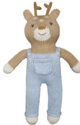
Bucky the Baby Stag DEERB 12"