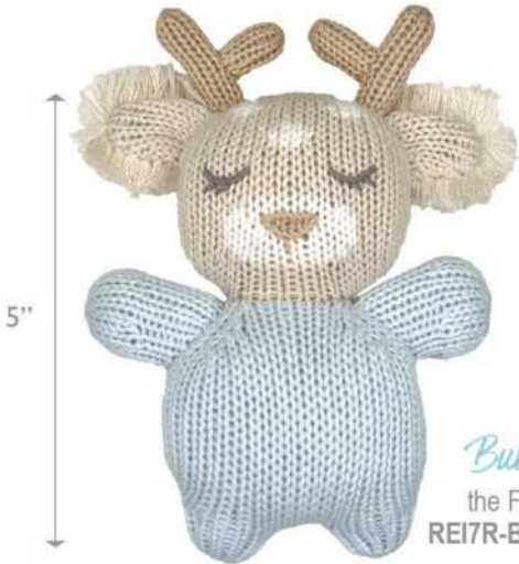
Bubbie the Fawn REI7R-BL (rattle)