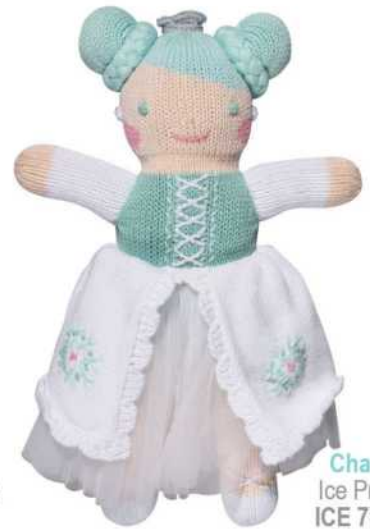
Charlotte Ice Princess ICE 7" (rattle) ICE 12" ICE 18"