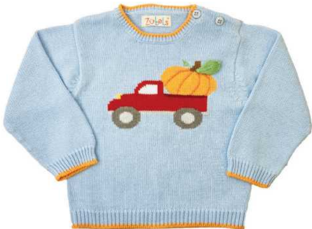
PUMTS - intarsia truck w/pumpkin & 3D leaf 6m, 9m, 12m, 18m, 24m/2y, 3y, 4y