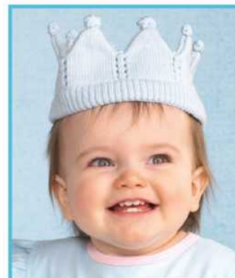
HAT - CROHB 6/12m, 1/2y, 2/3y