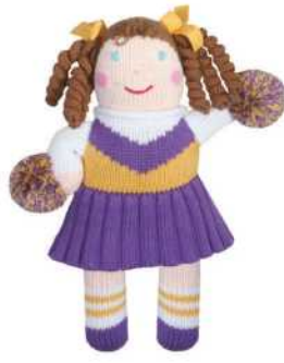
CHE 7" PU/GLD CHE 12" PU/GLD