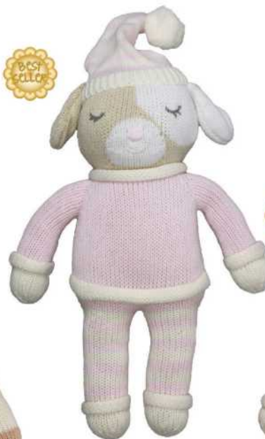
Puddin' Puppy in PJ's ready for her nap DOGG12"