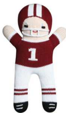
FP 7" MAR/WH FP 12" MAR/WH