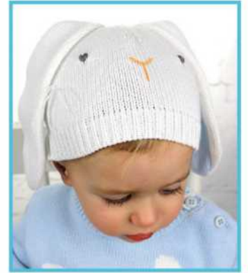
HAT - BUNBH 0/6m, 6/12m, 1/2y, 2/3y