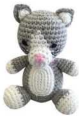
CAT 4" (non-rattle)