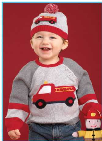
SWEATER - FTS 6m, 9m, 12m, 18m, 24m/2y, 3y, 4y