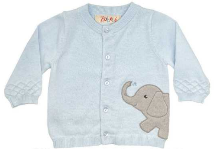
ELEBC - elephant appliqué w/texturen knit details 3m, 6m, 9m, 12m