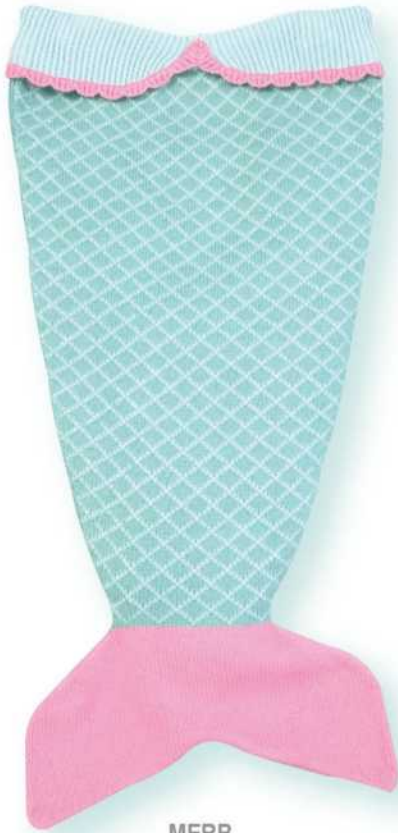
MERB Mermaid Tail Blanket