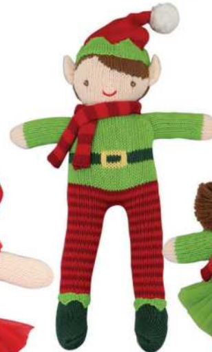
Everett the boy Elf ELB 12"