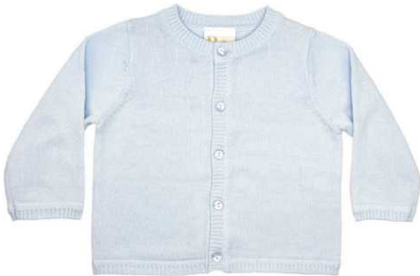
Ladder Edge Cardigan