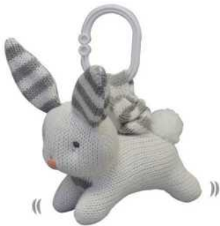
JITBU Jitter toy