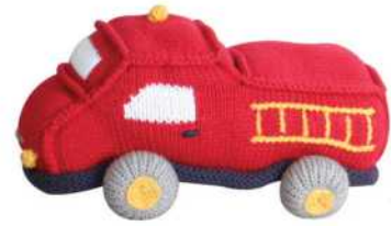
Chuck the Firetruck FIRT 6"