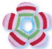
Multi-color flower FL6"AQ