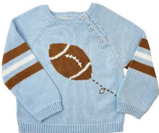
FTBS - intarsia football w/embroidered action line 6m, 9m, 12m, 18m, 24m/2y, 3y, 4y