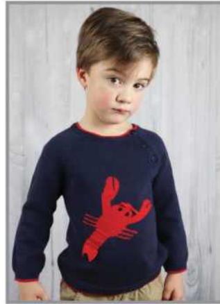
LOSX-NY Special $19 5y, 6y, 7y