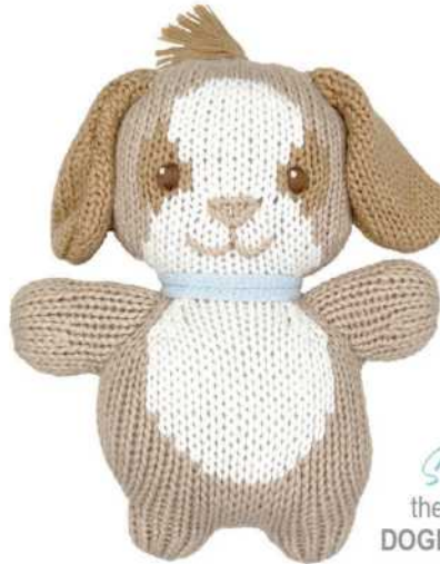
Scoops the Puppy DOGB7R (rattle)