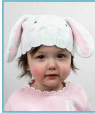
HAT - BUNGH 0/6m, 6/12m, 1/2y, 2/3y