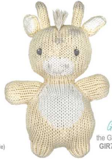
Gi Gi the Giraffe Calf GIR7R (rattle)