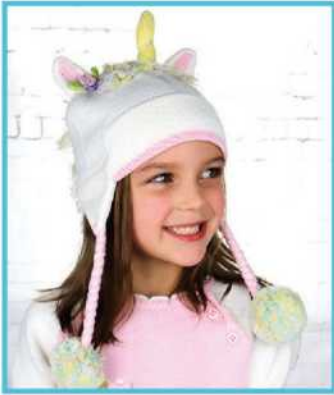
HAT - UNIH 0/6m, 6/12m, 1/2y, 2/3y