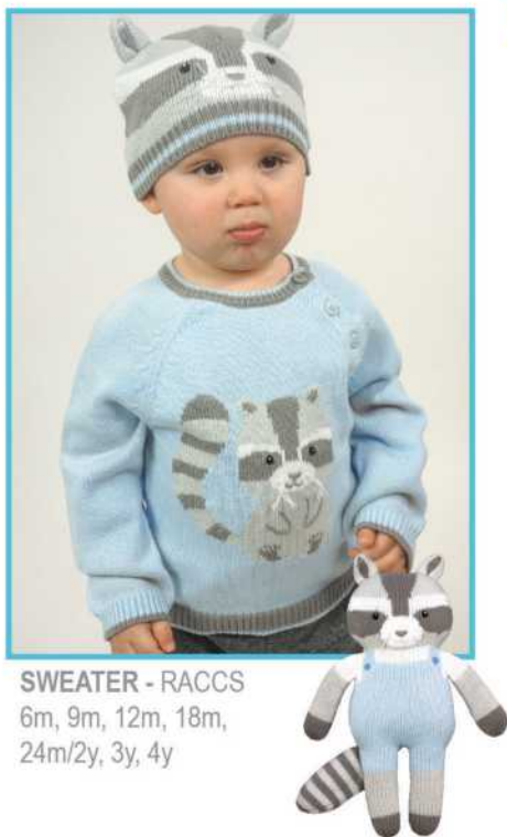
SWEATER - RACCS 6m, 9m, 12m, 18m, 24m/2y, 3y, 4y