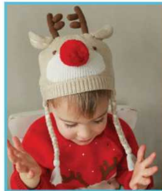
HAT - REIH 0/6m, 6/12m, 1/2y, 2/3y