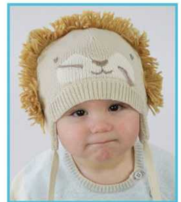
HAT - LIOH 0/6m, 6/12m, 1/2y